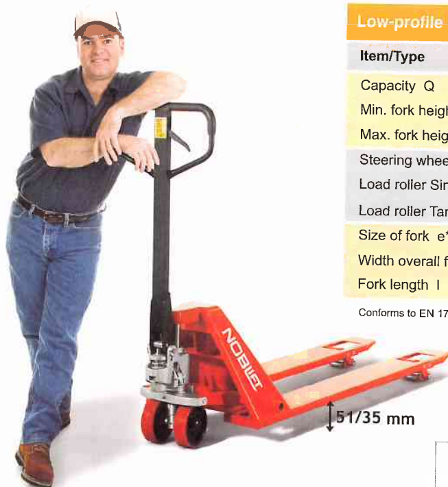
Low-profile Pallet Truck(51MM/35MM) 1KG=2.2LB 1INCH=25.4MM